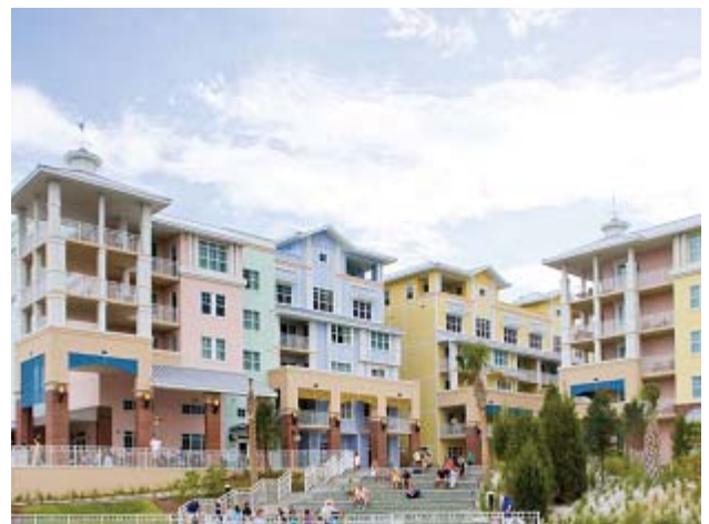
The Village at Wild Dunes 5757 Palm Boulevard, Isle of Palms, SC 29451

Cardiologists Cardiac Care Team Members (RN, NP, CNS, PA, PharmD) Practice Managers Fellows